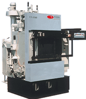
AMA Universal - Surface Treatment CS Series 250