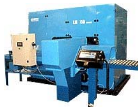
AMA Universal - Surface Treatment LM Series 150