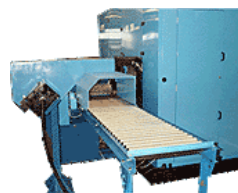
LM 150 - EXIT