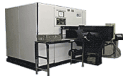
LM 175 S