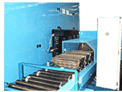
LM 150 - ENTRANCE